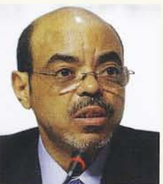
H.E. Meles Zenawi Former Prime Minister of Ethiopia