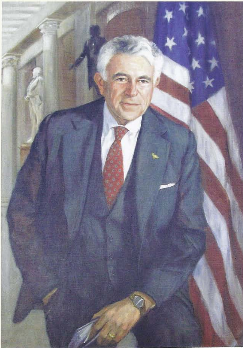
Hon. Benjamin A. Gilman