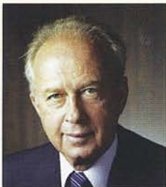
H.E. Yitzhak Rabin Former Prime Minister of Israel