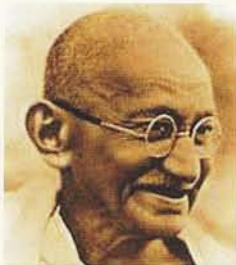
Hon Mahatma Gandhi, India* Pre-eminent political and ideological leader of India