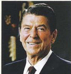
President Ronald Reagan, U.S.A. Former President of the United States