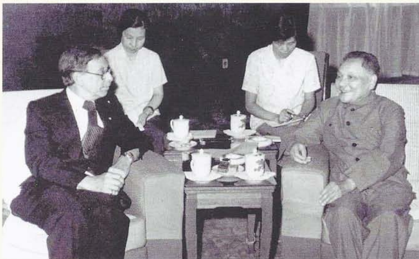
Hon. Lester Wolff and Deng Xiaoping in China, 1978

“He shall judge between the nations, and shall decide disputes for many peoples; and they shall beat their swords into plowshares, and their spears into pruning hooks; nation shall not lift up sword against nation, neither shall they learn war anymore” Isaiah 2:4 ESV