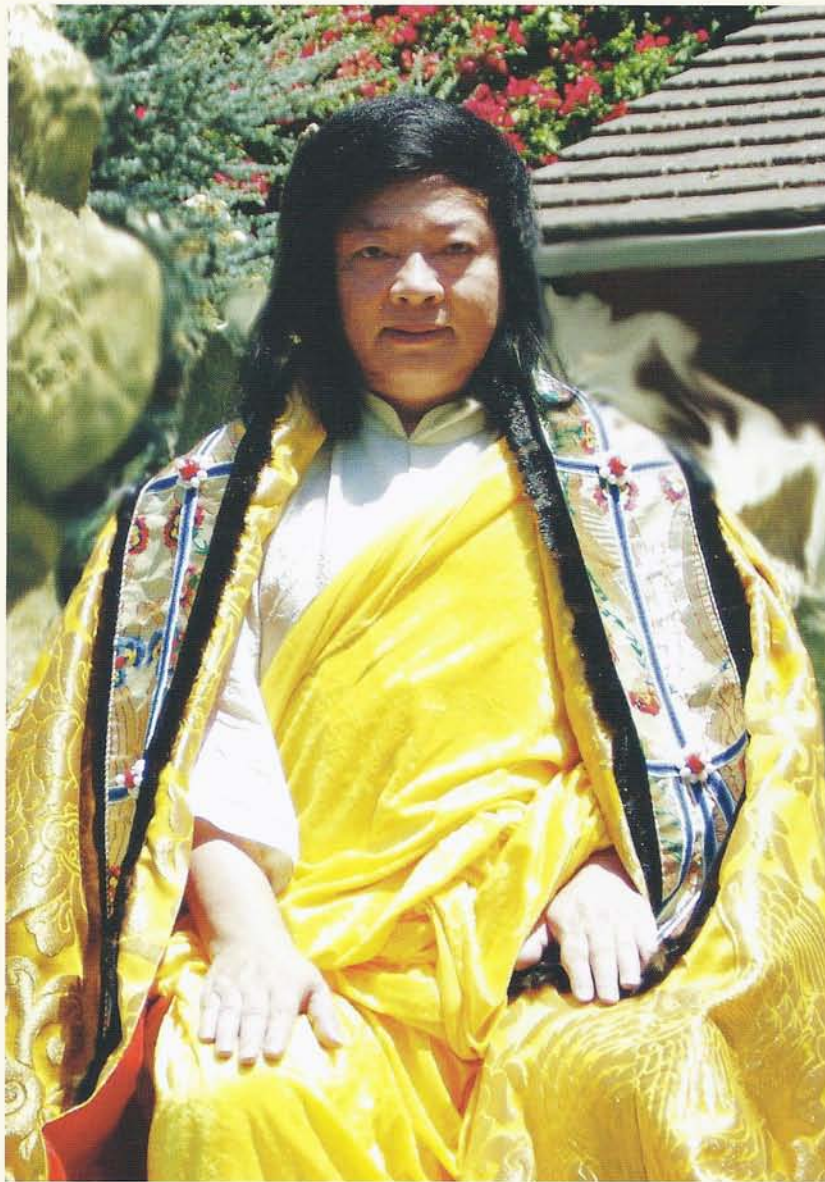
H.H. Dorje Chang Buddha III