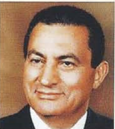
H.E. Hosni Mubarak Former President of Egypt