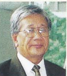
H. E. Kuniwo Nakamura Former President of Palau