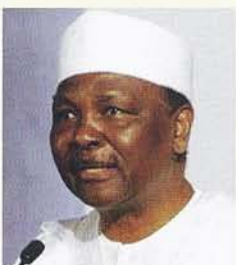
Gen. Yakubu Gowon Former President of Republic of Nigeria