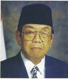
H.E. Abdurrahman Wahid Former President of Indonesia