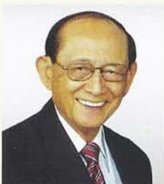
H.E. Fidel Valdez Ramos Former President of Philippines