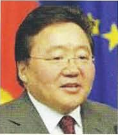
H.E. Punsalmaagiin Ochirbat Former President of Mongolia