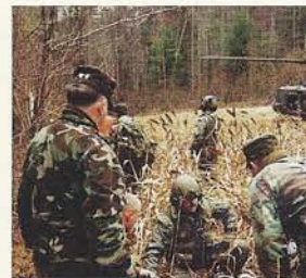
Civil Air Patrol