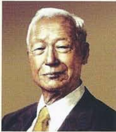
H.E. Syngman Rhee Former (first) President of South Korea